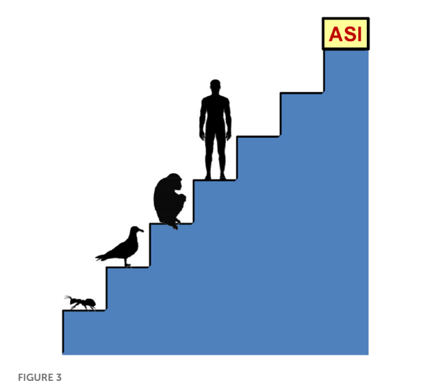
Comparison between an artificial superintelligence (ASI) and the intelligence of some living beings.

In 1965, British mathematician Irving J. Good envisioned the advent of superhuman intelligence, noting that an ultraintelligent machine could design ever-better machines, triggering